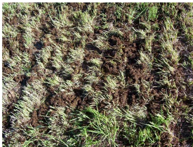
Figure 1. 20 tons/acre of semi-solid dairy manure on orchardgrass stubble.

manure should be applied at one time, unless harvesting for the season is completed. Higher rates greatly increase the chances of manure contamination of harvested grass forage. Manure particles picked up at harvest can infect the forage with detrimental organisms, resulting in poor fermentation of silage. There is also the possibility of transferring pathogens such as Johne's disease this way.